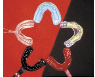
The mouth-formed mouthguard.

Generally, a mouthguard covers only the upper teeth, but in some cases the dentist will make a mouthguard for the lower teeth as well. Your dentist can suggest the right mouthguard for you.