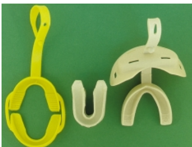
The ready-made mouthguard.